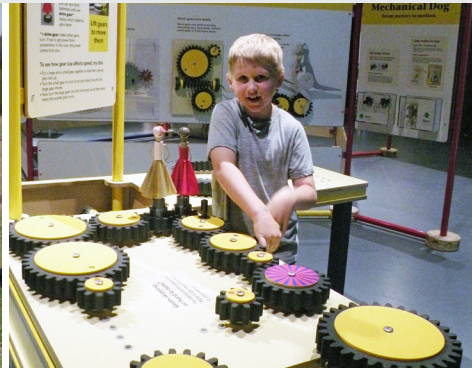
TOYs: The inside Story at BCM&CC