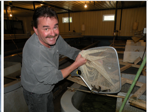
Lake Huron Fishing Club - Fish Hatchery

The following summarizes items of interest or milestones achieved by Nuclear Waste Management and across OPG: