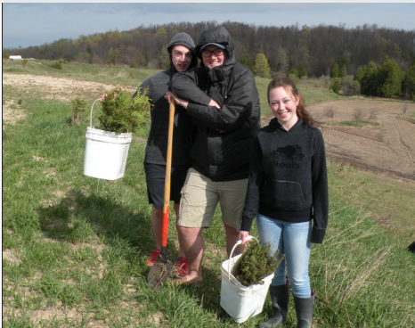
Penetangore River Tree Planting Day

OPG's Nuclear Waste Management (NWM) manages three sites. The Western Waste Management Facility (WWMF) in Bruce County receives and manages the low- and intermediate-level waste for Darlington, Pickering and Bruce Power nuclear stations. The volume of low-level waste is reduced through incineration or compaction. Used-fuel Dry Storage Containers are managed at facilities located at Pickering, Darlington and WWMF.